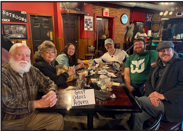
Great Odin's Raven, Week 1 Winners