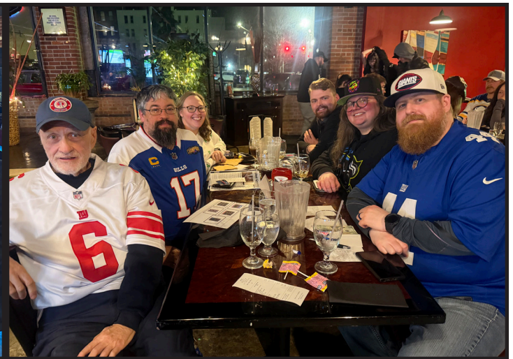
Effin Judo Chop, Week 2 Winners