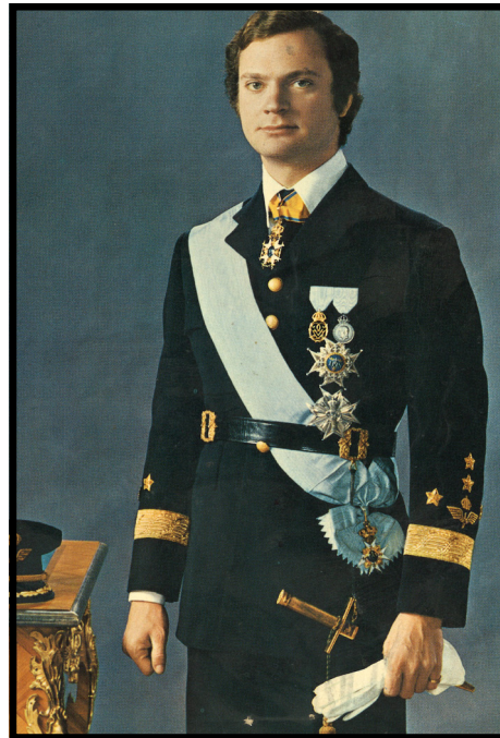
King Carl XVI Gustaf

I am getting ready to install the "50th Anniversary of the King of