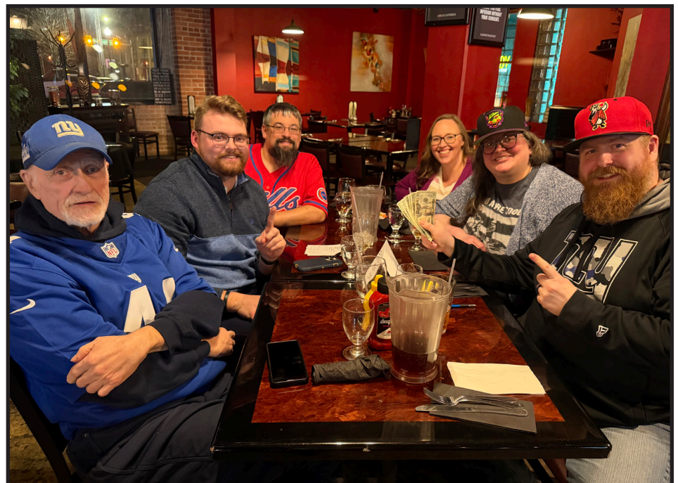
Effin Judo Chop on Week 4, Overall Winners

In fourth place overall with 289.5 points was Reuben's Raiders.