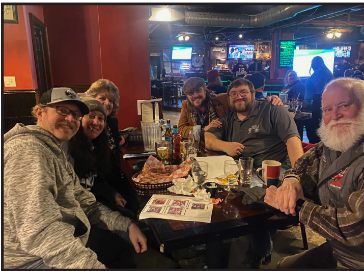
Great Odin's Raven, Week 3 Winners