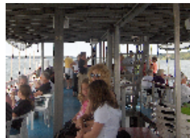
Campers on the Chautauqua Belle