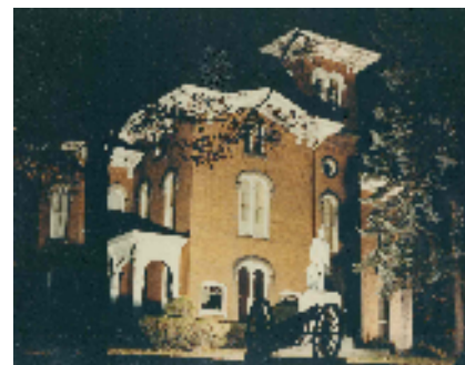
State of the Arts

Chautauqua Region Community Foundation $4,581 Sam's Club $500 Upstate History Alliance $256 NYSCA Regrant Program $2,400 Johnson Foundation $7,500 Lenna Foundation $20,000