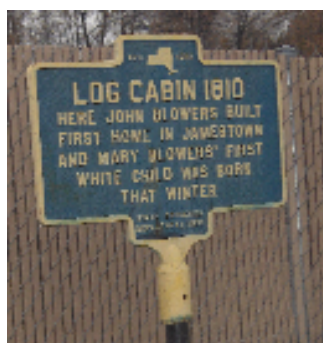
2010 Time Capsule