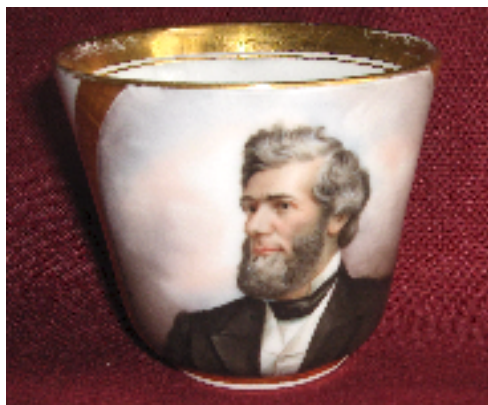
The Fenton Cup