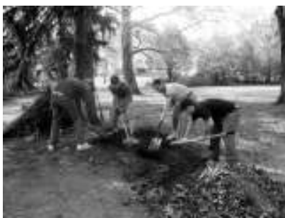
JBC Students help with spring cleanup