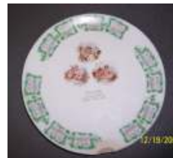
“The Fair” a store that carried a wide variety of household needs. 1912