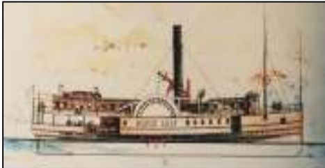
Treasures from Jamestown’s River: The Chadakoin