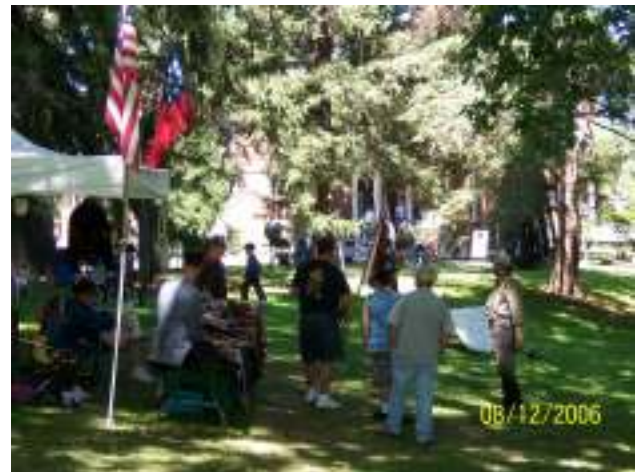
Old Fashioned Day teaches about the Civil War in Chautauqua County

The Fenton History Center is a community resource for people of all ages from the preschool child just learning to read to the senior citizen who still finds something new to learn each day. The resources (collections, library/archives and educational resources) and services (exhibits, research assistance and educational programming) found at the FHC are tied to community interests and reflect what the community cares about. The FHC will continue to develop innovative methods of meeting community interests and priorities – such as the Junior Historians, History Club, Summer Camps, Adult History Club and Genealogy Support Group, historical readings – while continuing to serve as an educational resource for children and adults, a place for families to enjoy together, and a part of the community’s heritage.