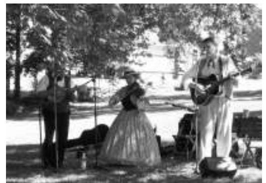
City Fiddle performing at Old Fashioned Day Event