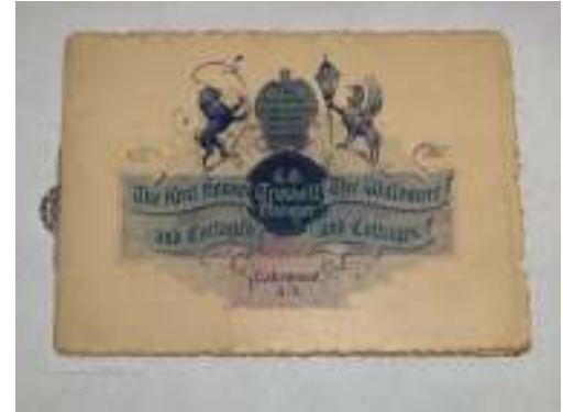
The Kent Hotel and the Waldmere Hotel 1897